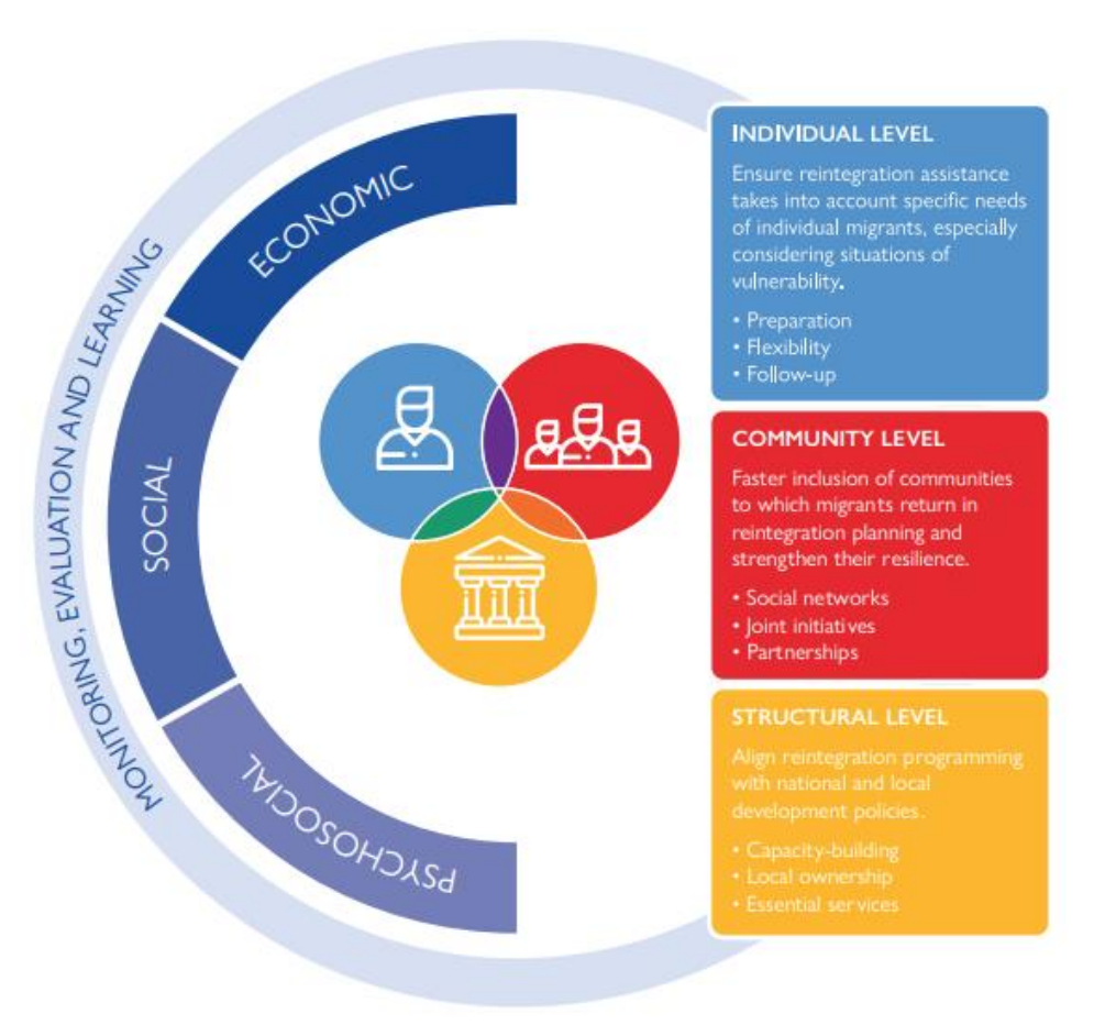
FIGURE 1. IOM'S INTEGRATED APPROACH TO REINTEGRATION