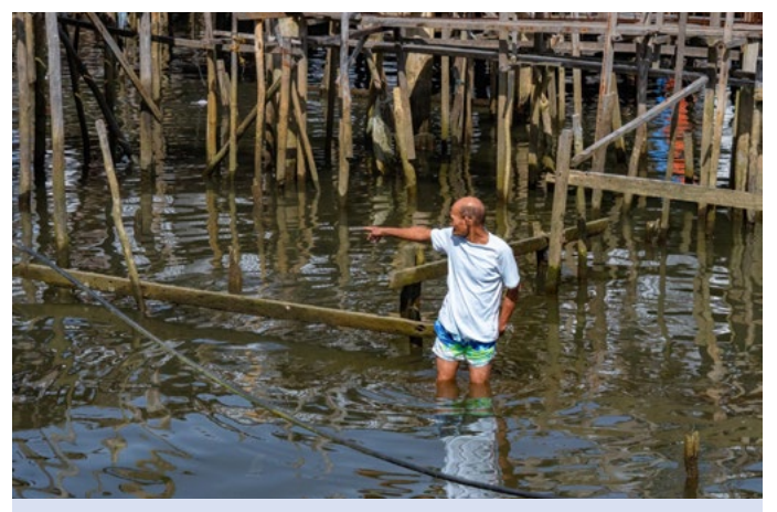
San Juan, the Philippines

migration and vulnerability to trafficking and generate learning about potential responses. Ethiopia and the Philippines have been chosen as target countries as they are both significantly impacted by the nexus of climate change and trafficking in persons.