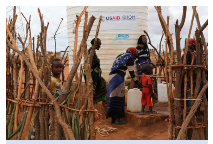
Oromia Region, Ethiopia

that their household does not have regular access to drinking water and 64 percent reported that the worst disaster they had ever experienced occurred in the last five years. The report gives a comprehensive overview of the affected populations' needs and recommendations for how to provide support amidst this multiform crisis.