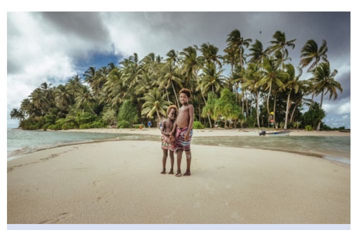
Bougainville, Papua New Guinea

World Bank estimates suggest that up to 132 million people will be pushed into extreme poverty as a result of climate change by the end of 2030 (World Bank, 2020).